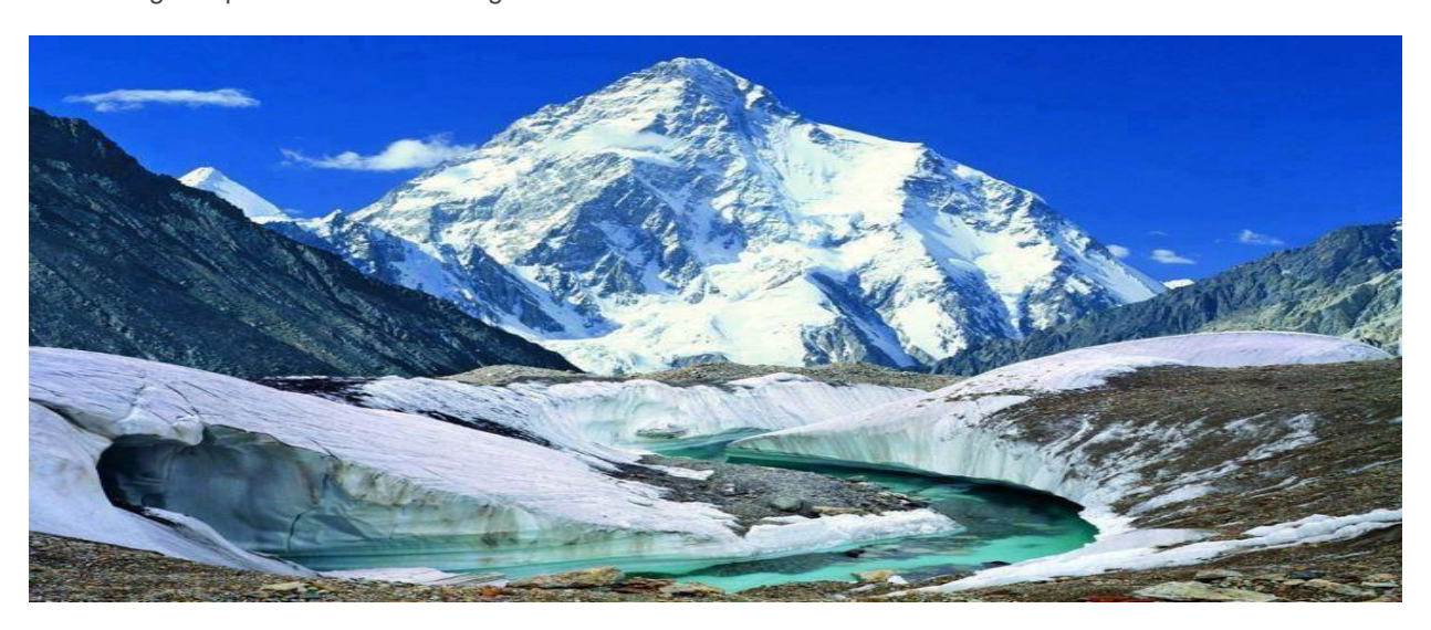
K2, Pakistan. K2 is the second-highest mountain on Earth, after Mount Everest. It is located on the border between Baltistan, in the Gilgit–Baltistan region of Pakistan, and the Taxkorgan Tajik Autonomous County of Xinjiang, China.

Tourism which currently makes up an insubstantial part of our earnings is believed to be elevated by opening of this economic corridor. The CPEC, some believe, will also boost tourism in the 73,000 square km region. The region is considered to be a mountaineer's paradise, since it is home to five of the 'eight-thousands' (peaks above 8,000 meters), as well as more than 50 mountains over 7,000 meters. It is also home to the world's second highest peak K2 and the Nanga Parbat.<sup>11</sup>