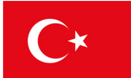
Turkey—listed the Nusra Front as a terrorist organization on June 13, 2014. 201