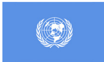
United Nations—listed the Nusra Front as an entity associated with Al-Qaeda on May 30, 2013. 203