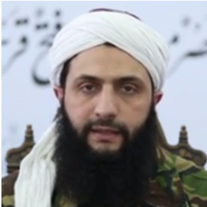
Abu Muhammad al-Golani Leader