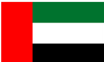
United Arab Emirates—listed the Nusra Front as a terrorist organization on November 15, 2014. 202