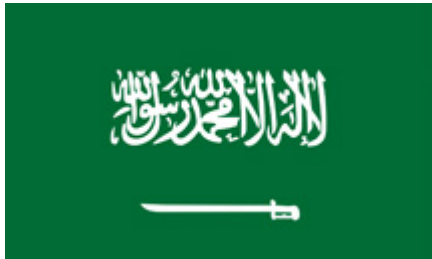
Saudi Arabia—listed the Nusra Front as a terrorist group on March 7, 2014. 200