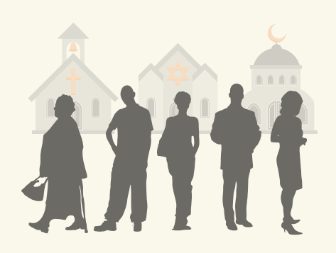
People of color, people of faith, and immigrants

Expands places where discrimination is prohibited to include: